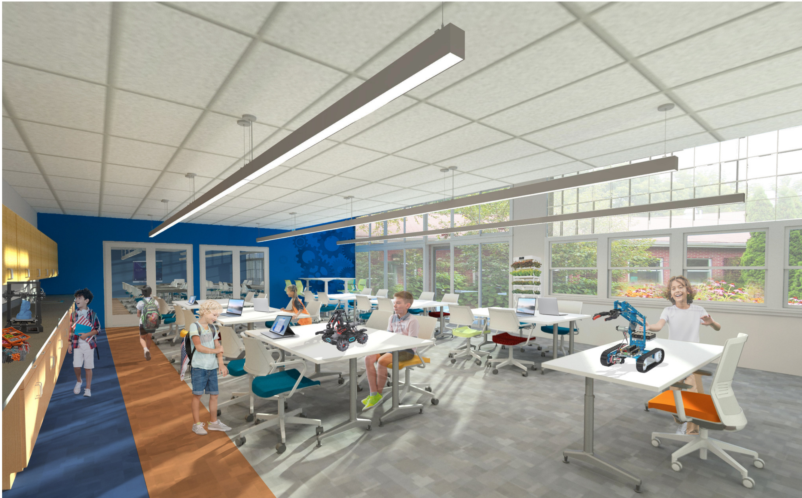
MTES INNOVATION LAB