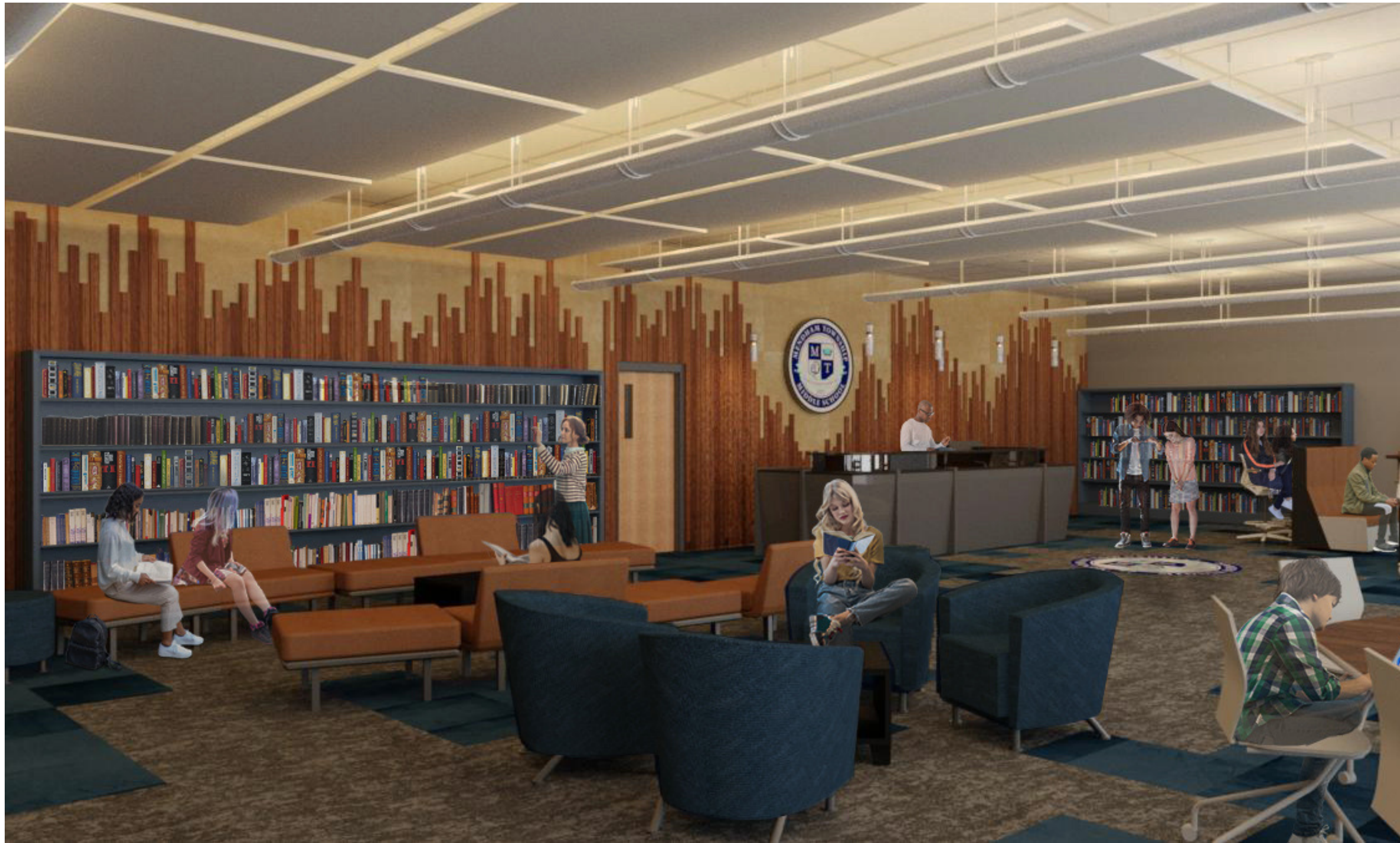
MTMS MEDIA CENTER