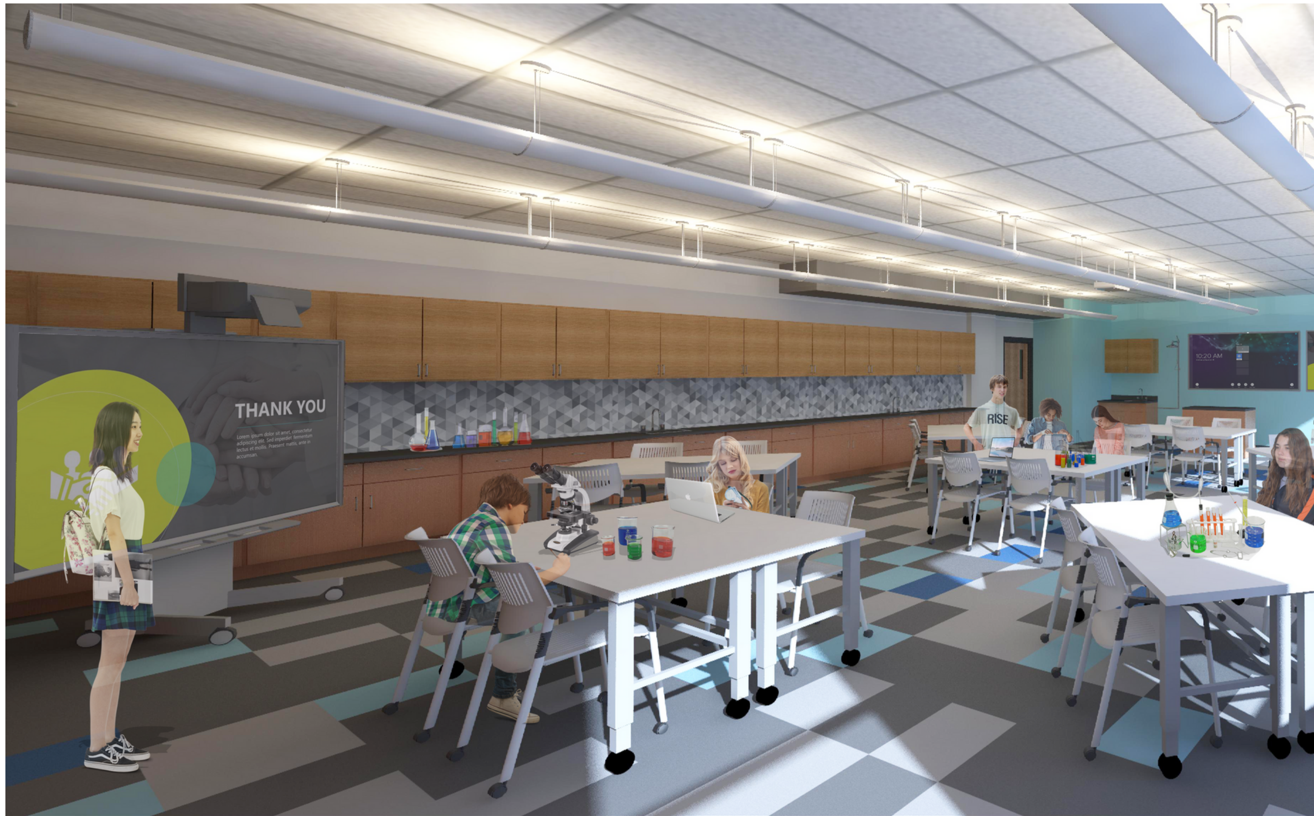
MTMS INNOVATION LAB