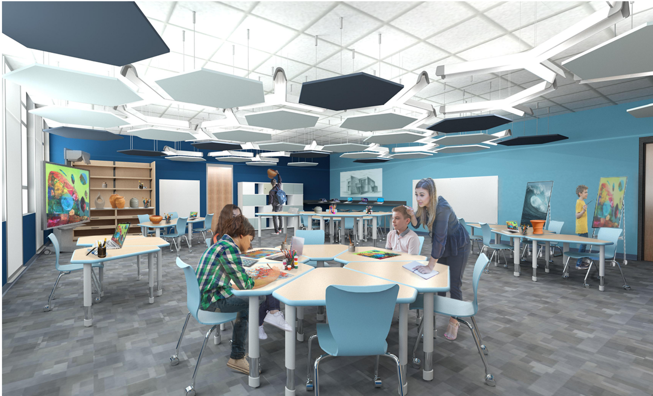
MTMS ART ROOM