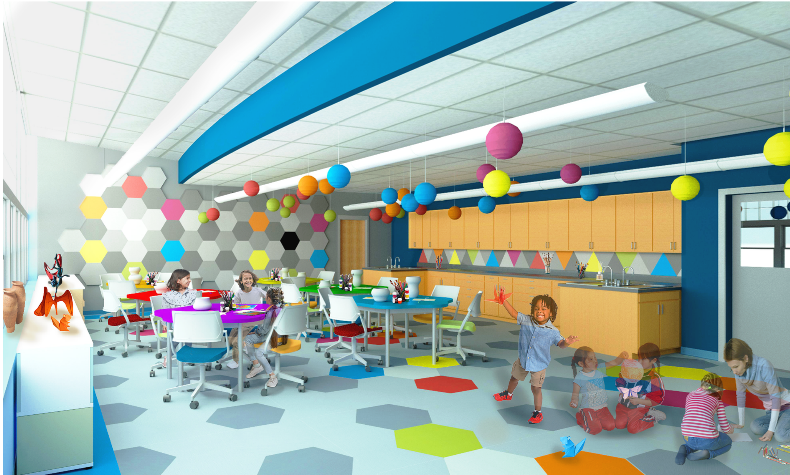
MTES ART ROOM