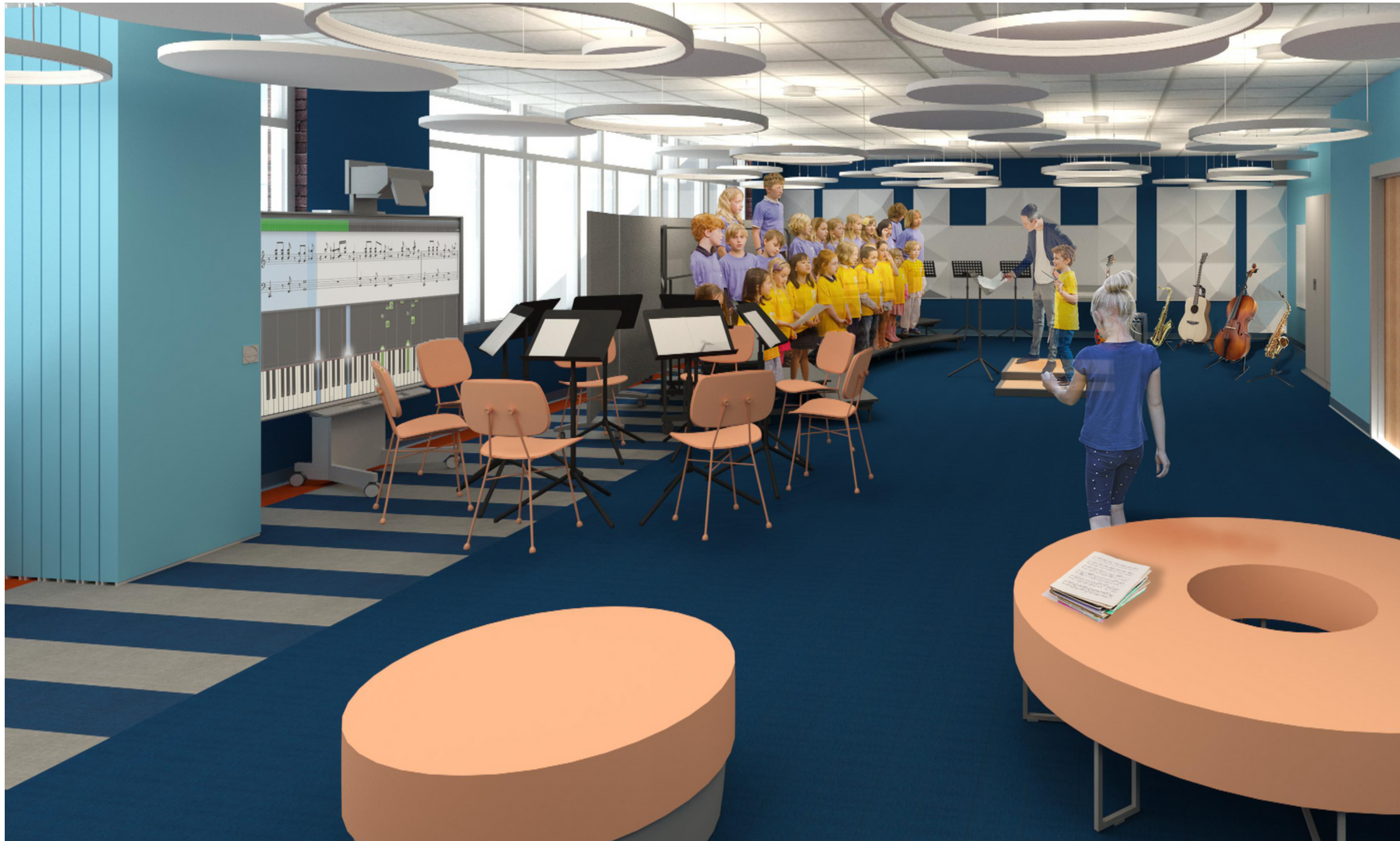
MTES MUSIC ROOM