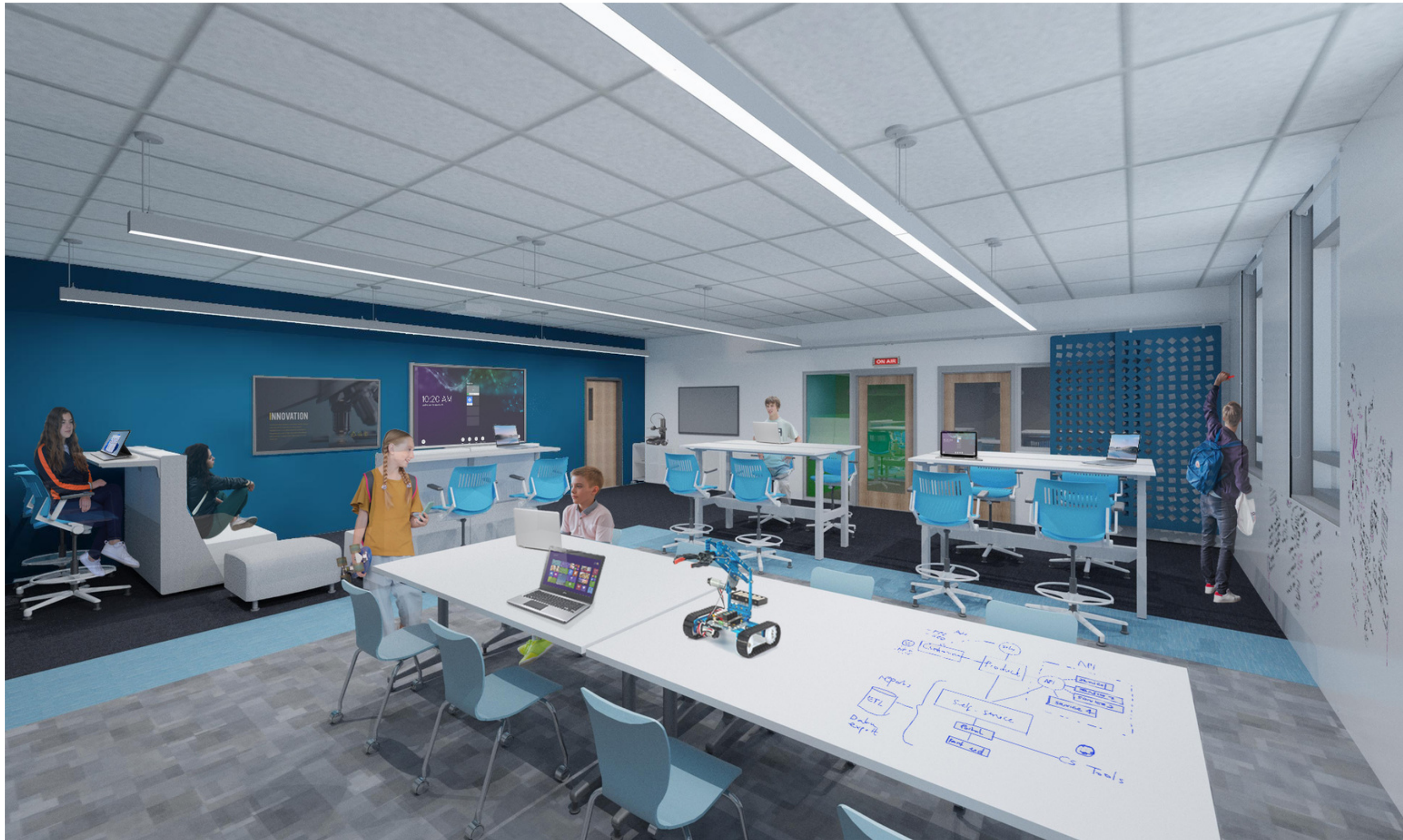
MTMS TECHNOLOGY LAB