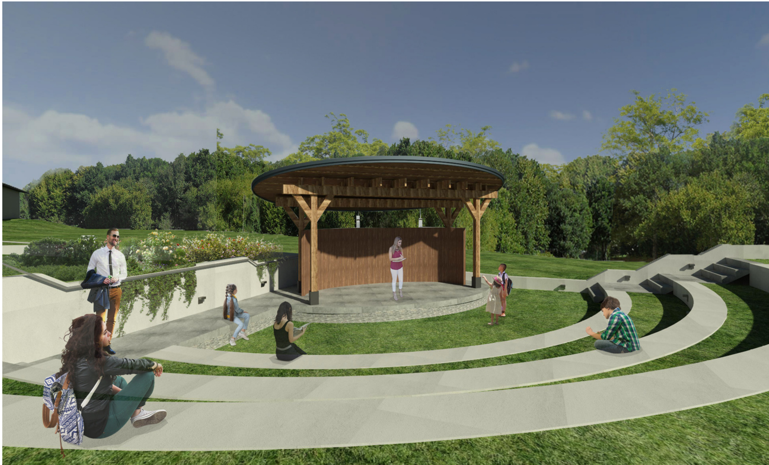
OUTDOOR CLASSROOM PAVILION