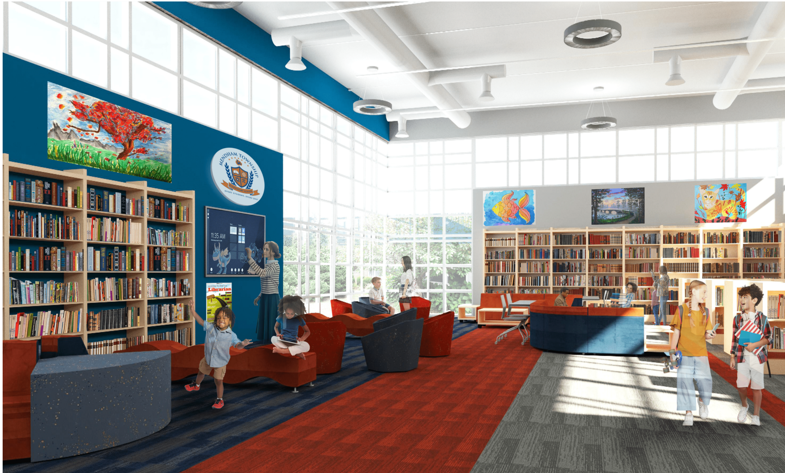
MTES MEDIA CENTER