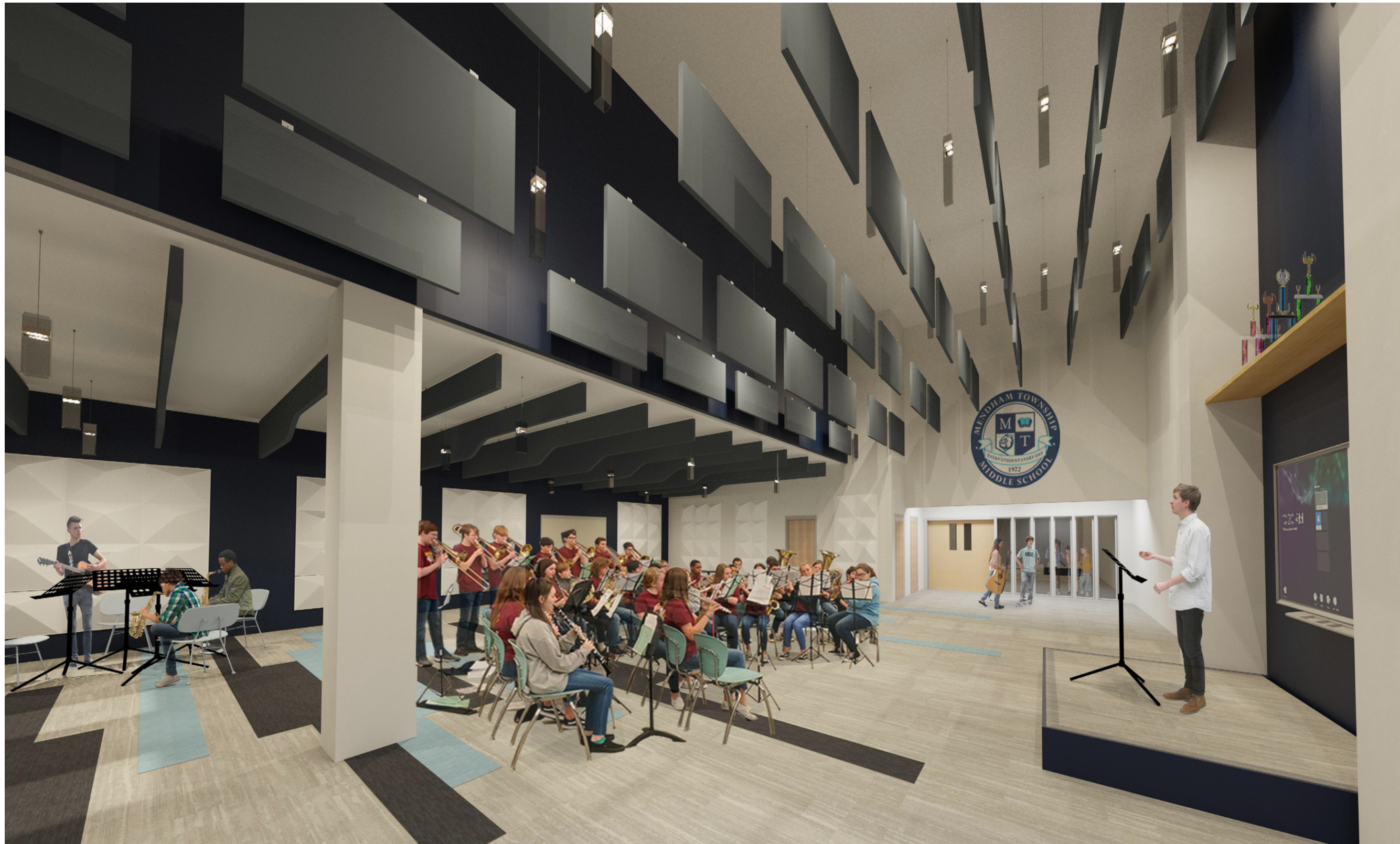
MTMS MUSIC ROOM