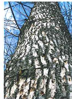
Woodpecker damage on an EAB infested tree