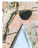
D-shaped exit hole