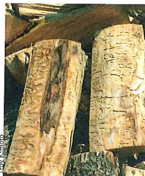
EAB infested ash wood

More information on the emerald ash borer www.emeraldashborer.nj.gov